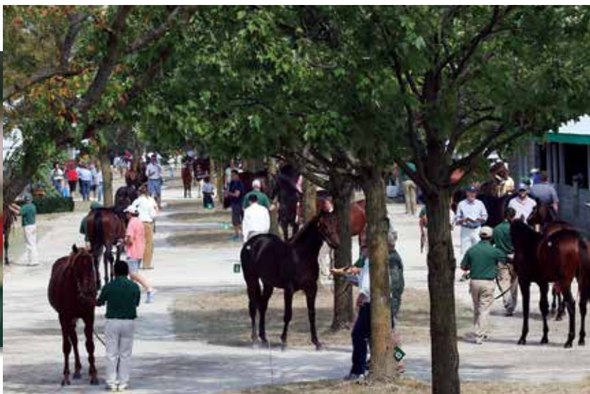
Keeneland/Photos by Z